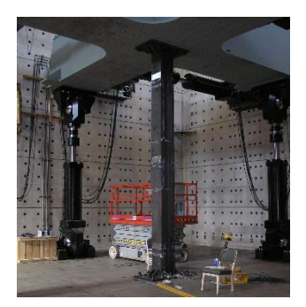
b) Structural Model

a) Physical Specimen b) Structural Mo Hybrid Simulation of a Steel Moment Frame